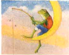
Fly Fishin' by Cynthia Westbrook

The mission of the Arts Council is to nurture and strengthen the artistic, cultural, and educational quality of the community and surrounding areas.